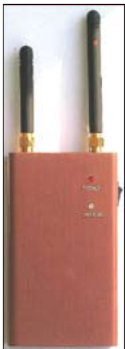
▲ L1 AND L2 jammer

from 20,000 kilometers above it. Signals reaching a receiver are easily swamped by even a thousandth of a watt of jamming signal radiated near by.