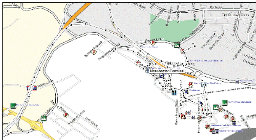
▲ FIGURE 1 Detailed tracks of routes travelled by a vehicle, each point dated and timed

Probably the most impressive forensic evidence involving GPS comes from the tracking systems now fitted to increasing numbers of trucks, trailers, delivery vans, and rental cars. Each vehicle carries a receiver that records its location and sends it at intervals to a tracking