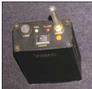
▲ LOW-POWER GPS jammer

The use of GPS jammers, long foreseen in navigation circles, has become a reality as criminals employ them to overcome tracking systems and steal vehicles. These low-powered transmitters (see PHOTO), readily available over the Internet for as little as $150, can block GPS reception in a vehicle's vicinity.