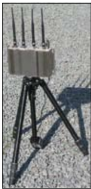
▲ HIGH-POWER jammer for GPS and mobile phone bands