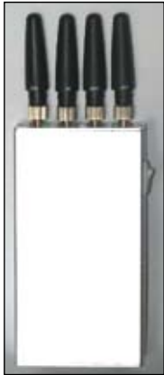
▲ JAMMER for GPS, GSM (900MHz), DCS (1800MHz) and 3G mobile bands